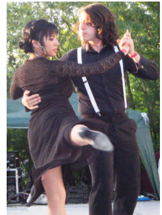
Right: Latin American Dancers